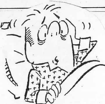
What a Horrible Dream!

I dreamed that the Lord took my weekly contribution to the church, multiplied it by ten, and turned this amount into my weekly income. In no time I lost all my furniture, and had to give up my automobile. Why, I couldn't even make a house payment. What can a person do on $10.00 a week?